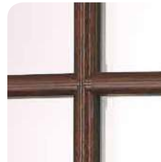
Georgian bars Shown in Rosewood

Our vertical sliding sash windows enable you to achieve a classic, distinctive look for your home, with all the high-performance, low-maintenance benefits of PVC-U. The windows echo the timeless styling of the Georgian era, with two sliding sashes, decorative horns and sculpted ovolo frames.