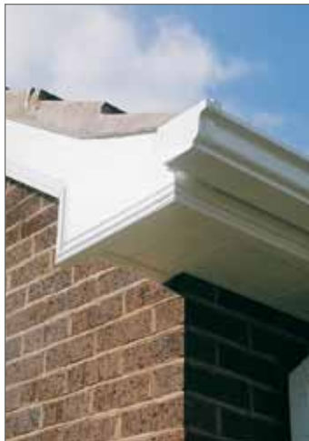
Decorative Ogee style fascia boards in White finish