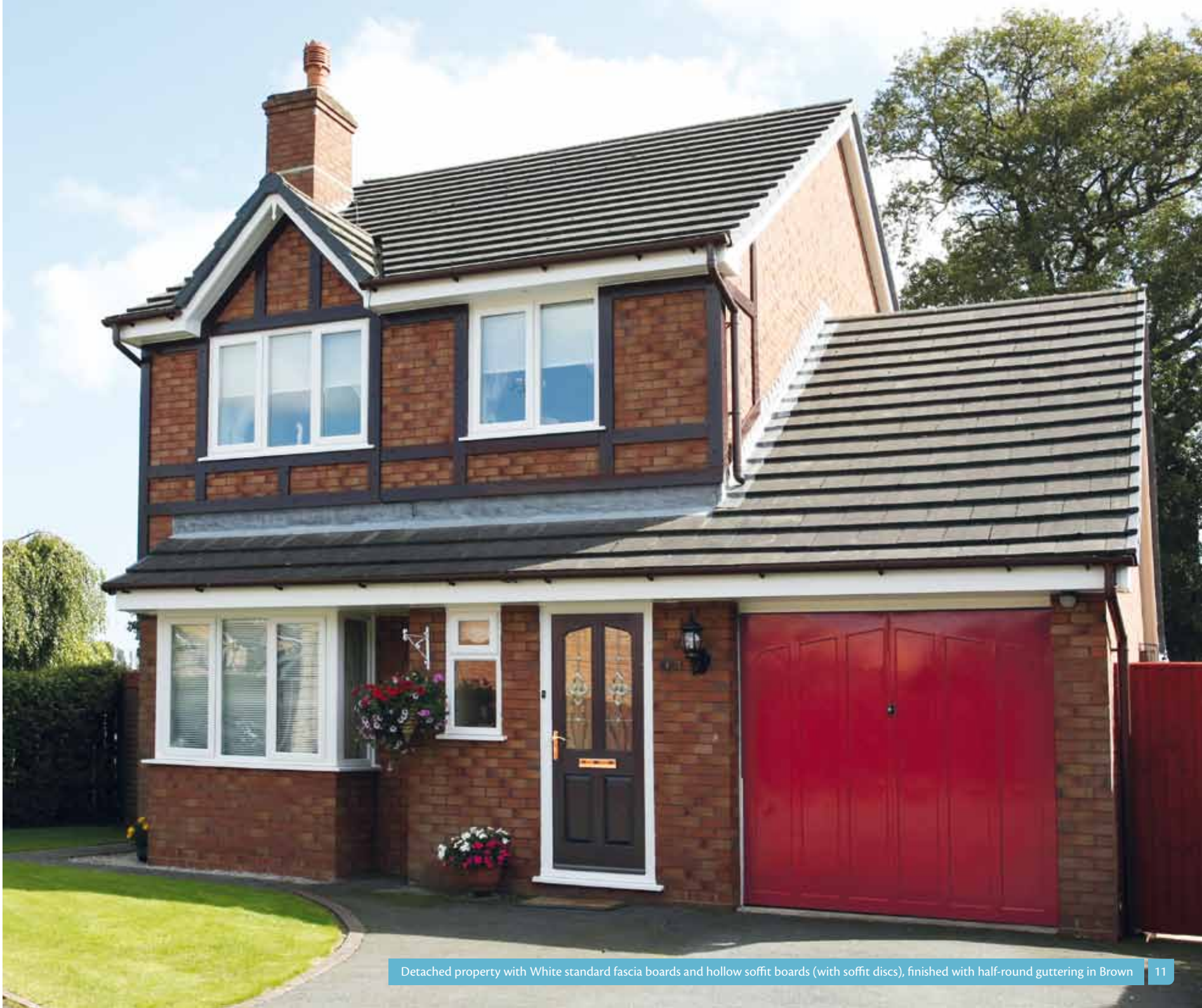
Detached property with White standard fascia boards and hollow soffit boards (with soffit discs), finished with half-round guttering in Brown