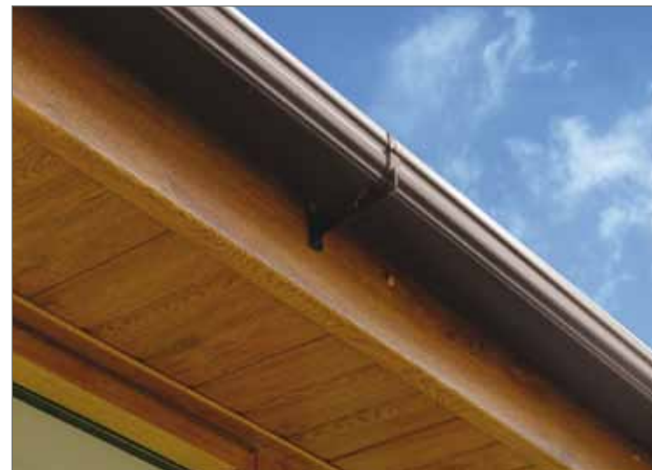
Universal Plus guttering shown in Brown

All styles of guttering come with a full range of matching accessories and fitting systems and offer an exact colour match with our roofline products. Cream-coloured guttering is available exclusively from Eurocell in the Universal Plus style, while ogee styling gives you the option of a more decorative, sculpted finish.