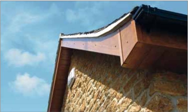
Standard fascia and hollow soffit board in Golden Oak, with Universal Plus guttering in Black

High-quality PVC-U fascia board is ideal for both new homes and replacement projects. Available in a standard flat profile or a distinctive sculpted 'ogee' style, it is easy to fit and makes a smart improvement to your home.