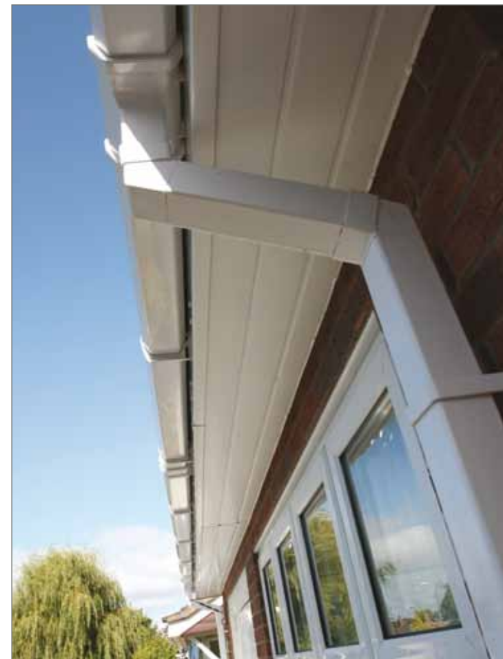
Square-line guttering shown in White