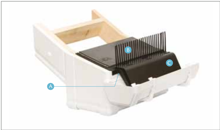
A roofline sample showing the 3 in 1 accessory used to enhance your roofline solution