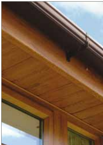
Property with standard fascia boards in Golden Oak finish

PVC-U fascias, soffits and roof trims will brighten up your property, giving it a fresh new lease of life. All roofline products are available in a range of colours and woodgrain finishes to suit individual property styles and personal tastes. You can also choose plain flat boards for a simple, contemporary look, or sculpted 'ogee' style options for a more decorative finish.