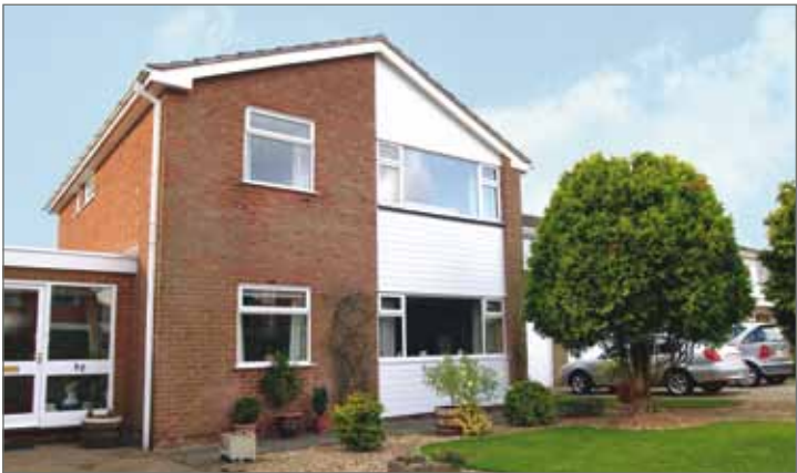
Shiplap cladding in a horizontal formation, in White finish

In addition to these individually available items, there is a 3 in 1 solution (as shown above) which combines: A Over-fascia ventilation which sits underneath the felt tray, B Eaves comb filler and C In-built felt tray which prevents the roof felt from sagging and stops pools of water from forming.