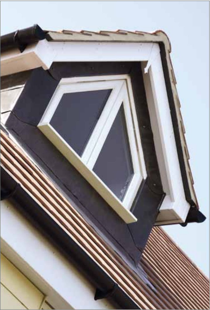
Standard fascia boards and utility boards in White, featuring decorative finial