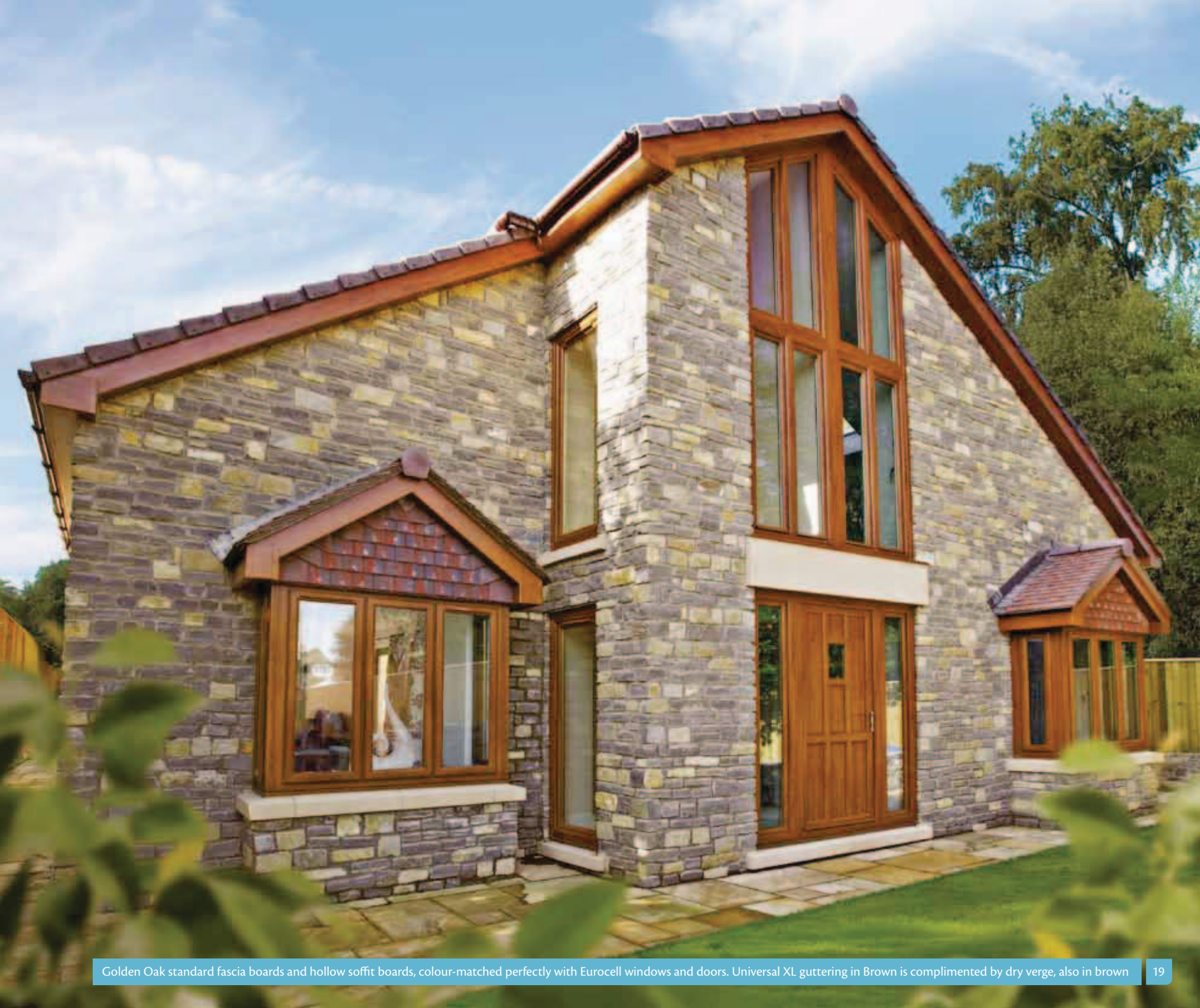
Golden Oak standard fascia boards and hollow soffit boards, colour-matched perfectly with Eurocell windows and doors. Universal XL guttering in Brown is complimented by dry verge, also in brown